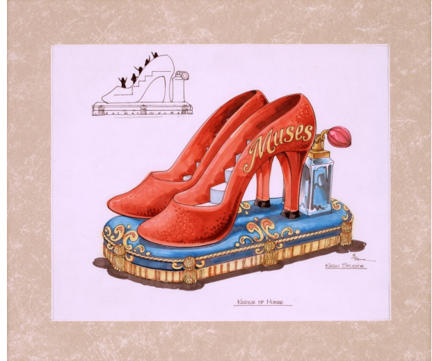
Concept sketch by Manuel Ponce, Krewe of Muses shoe float. Courtesy of Krewe of Muses.