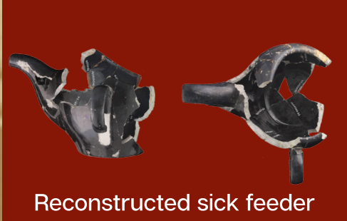
Reconstructed sick feeder