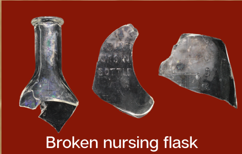
Broken nursing flask

In 2016, archaeologists excavated a privy (outhouse) from the 1897 Yellow Fever hospital in New Orleans and recovered numerous artifacts. The photos below illustrate items used by patients and doctors.