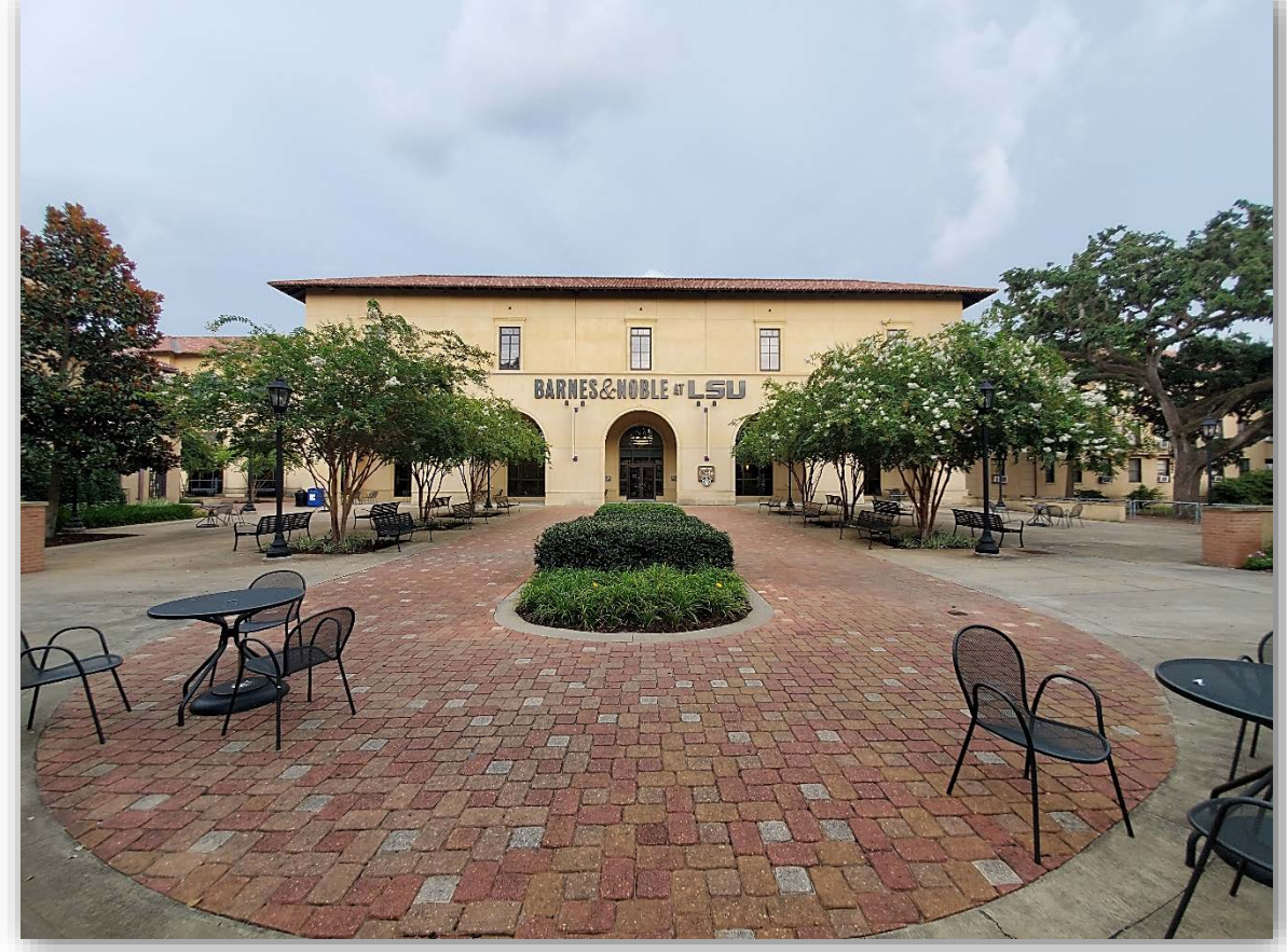
LOUISIANA PERCENT FOR ART PROGRAM: LOUISIANA STATE UNIVERSITY