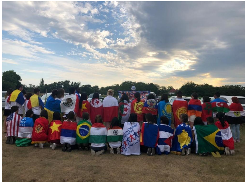
Above: Participants from the 2019 CIFGE Center in Strasbourg