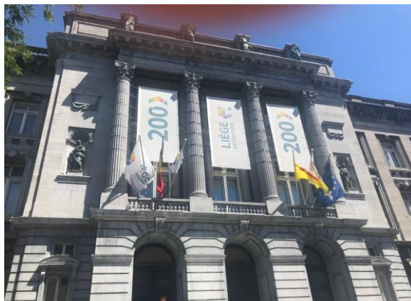
Left: L'Université de Liège