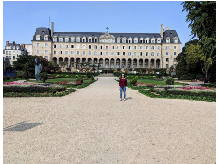
Lacie Langley, Escadrille Louisiane (EL) participant