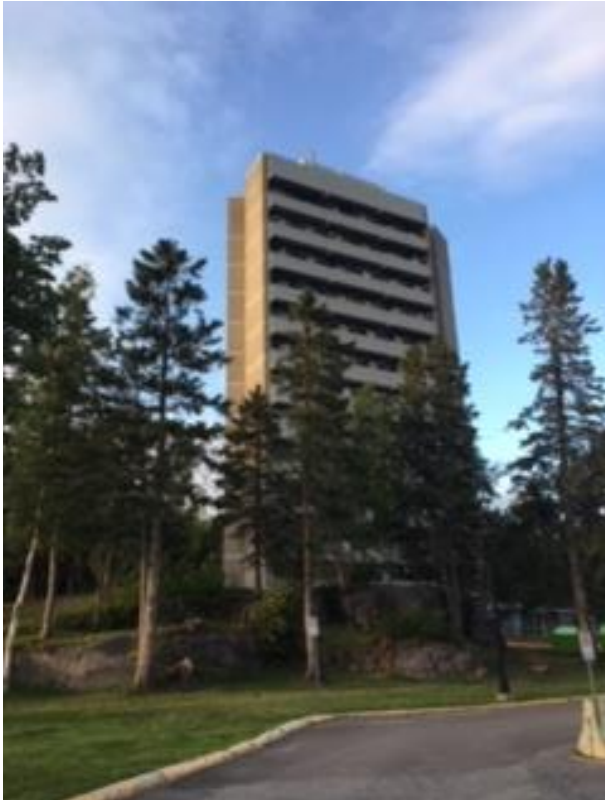
Above: Jonquière College