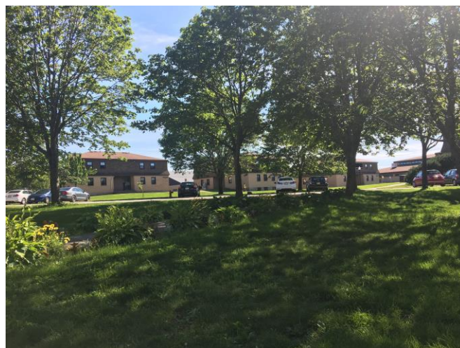
Above: Université Sainte-Anne campus