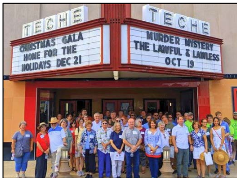
Image taken October 5, 2019 as part of the LA Trust for Historic Preservation's Fall Ramble highlighting historic and cultural sites in Franklin Parish.